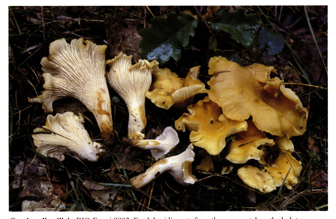
Cantharellus ilicis. BIO-Fungi 9983. Fresh basidiomata from the same patch as the holotype.