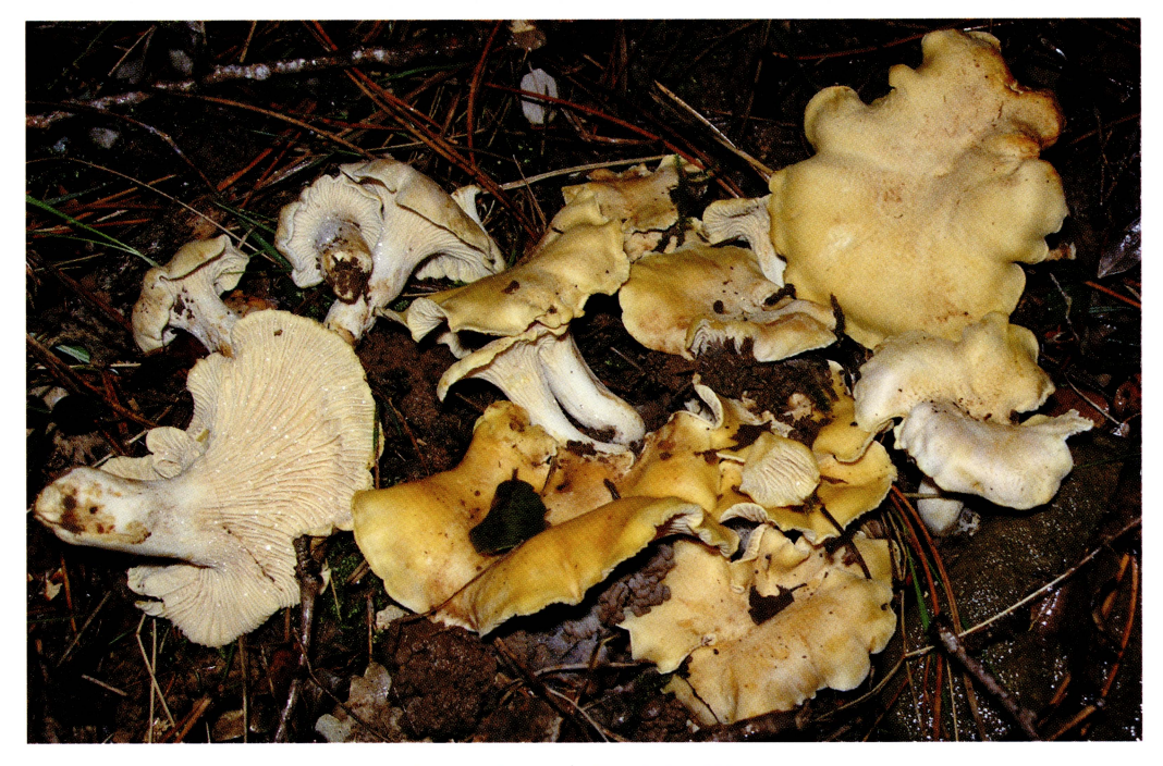
Cantharellus ilicis. Holotype, BIO-Fungi 11689. Fresh basidiomata.